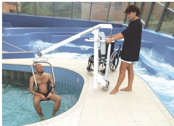
Figure 3: The SureHands Wheelchair-to-Water Pool Lift (with the Body Support) from SureHands Lift & Care Systems is a motorized pool lift that enables the user to transfer directly from a wheelchair to the water.

A pool lift transfers people with mobility disabilities into a swimming pool. Models vary according to the hoisting and lowering mechanism (hydraulic, drive, or geared lifting mechanisms), whether a lift is portable or permanent, whether it is self- or attendant-operated, and whether the model is geared towards institutional or residential use. Models are available for deck-level pools, above-ground pools, or both. Maximum weight capacity varies from 300 to 400 pounds. Transfer seats may be sling or chair types, most of which have belt or safety strap options, or body supports that lift under the arms while providing support to a person's upper body and thighs. Some models are available with head supports, chest supports, or adjustable leg supports.