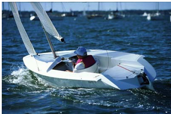
Figure 6: The Martin 16 Sloop, made by Abbott Boats and sold by Inventure Management Limited, is an accessible sailboat with adjustable seating, joystick rudder controls, and one hand sail controls.

Controls: To accommodate persons with limited mobility or upper extremity disabilities, adaptive sailboats may have sail control lines designed for one hand use and/or operation from a single seated position. Adaptive rudder controls include joystick steering.