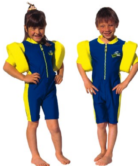
Figure 4: The Two-in-One Flotation Sun Suit from SwimEEZY USA is a combination swim suit, sun suit, and swimming aid designed for use by children with physical disabilities. The suit blocks 98 percent of the sun's ultraviolet (UV) rays, while Airex foam at the shoulders provides buoyancy.

Adaptive swim wear is available for children and adults who want to participate in water sports or just visit the beach or lounge around the pool. Swim wear includes buoyant swim vests; clothing to insulate the body against loss of body heat; clothing that can be put on or taken off with snap or Velcro fasteners or full-length side zippers; and ear muffs to prevent water from entering the ear during exercise or play.