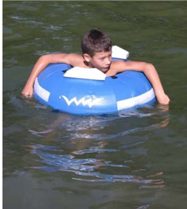
Figure 1: The Water Walker from Aquatic Therapy enables users with physical disabilities to remain upright for water-based therapy and exercise.

Flotation devices are designed to keep either a person's entire body or specific parts of the body afloat. Most flotation aids are made of vinyl-coated soft flotation foam with adjustable straps to attach around arms, legs, the torso, the head, or the neck. Sizes are usually based on the user's weight. Flotation devices are useful for persons with some head and neck control and to help compensate for uneven weight distribution. In addition to helping a person maintain a horizontal floating position, some models will maintain vertical positions in the water for walking/gait exercises and for games such as water polo.