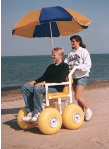
Figure 5: The All Terrain Chair from Assistive Technology, Inc. is a beach wheelchair with balloon wheels for moving on sand.